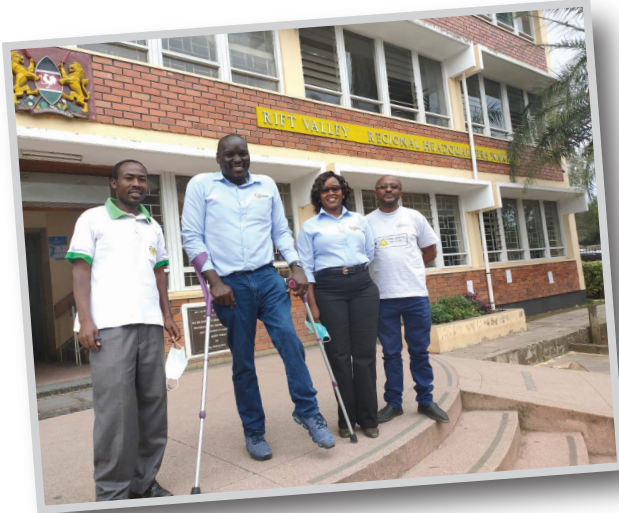
South Rift Regional Team