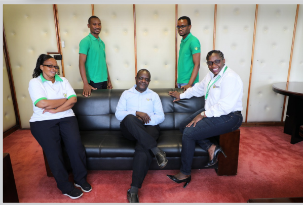
Head Office Team