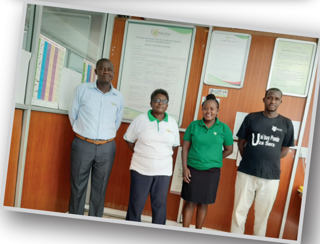
Nyanza Regional Office Team