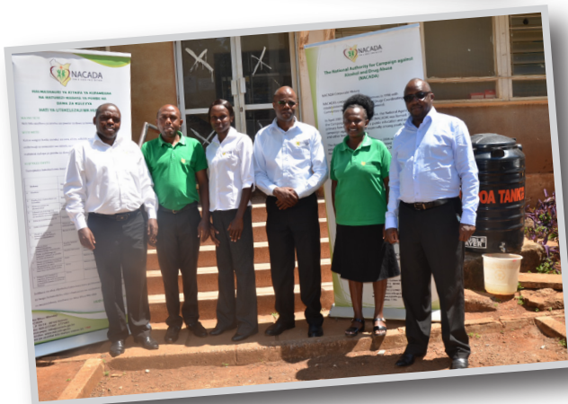
Central Regional team